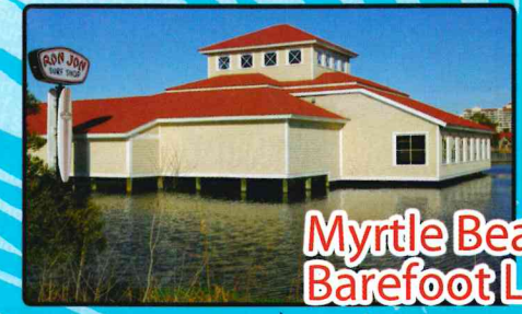
Myrtle Beach Barefoot Landing