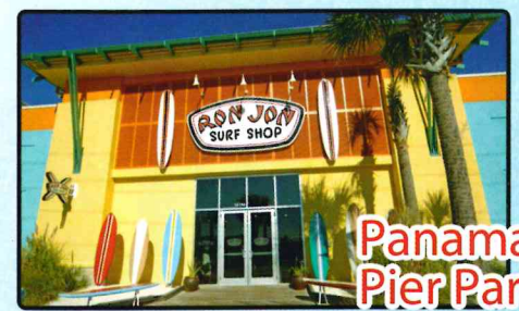
Panama City Beach Pier Park