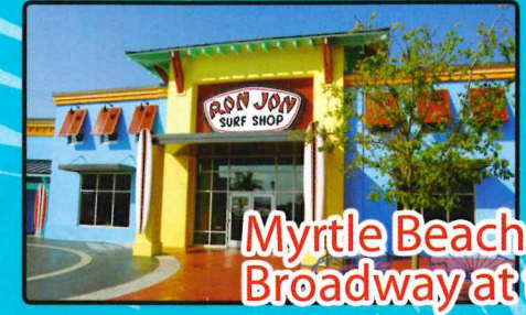
Myrtle Beach Broadway at the Beach