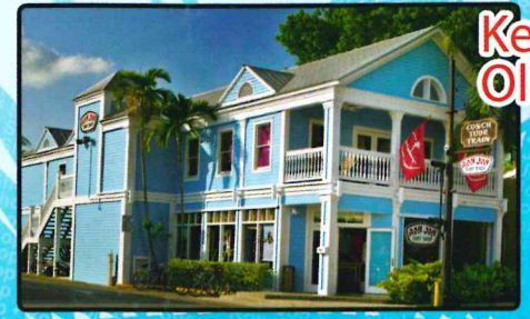
Key West Old Town