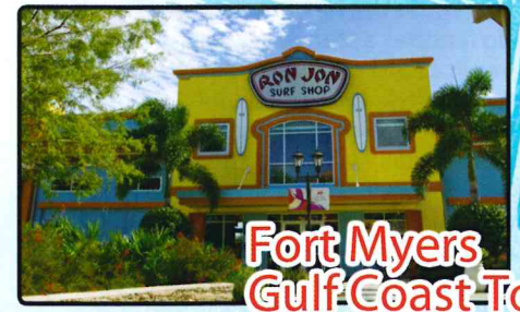
Fort Myers Gulf Coast Town Center