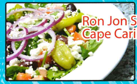
Ron Jon Surf Grill at Cape Caribe Resort