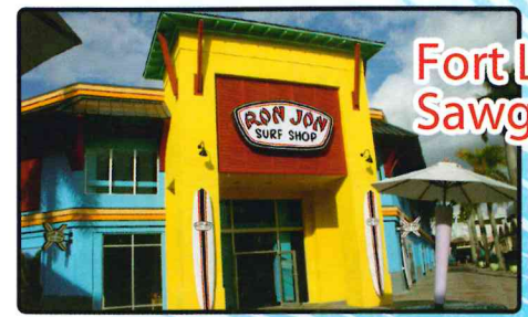
Fort Lauderdale Sawgrass Mills