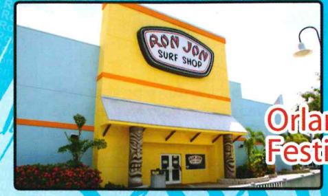
Orlando Festival Bay